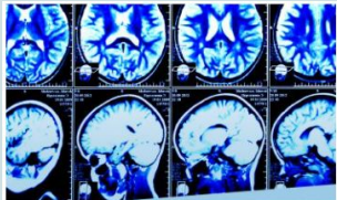
UCAT (University Clinical Aptitude Test for Medicine)