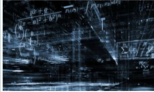
MAT (Mathematics Admissions Test)