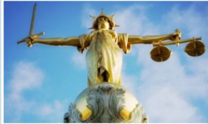
LNAT (Law National Aptitude Test)