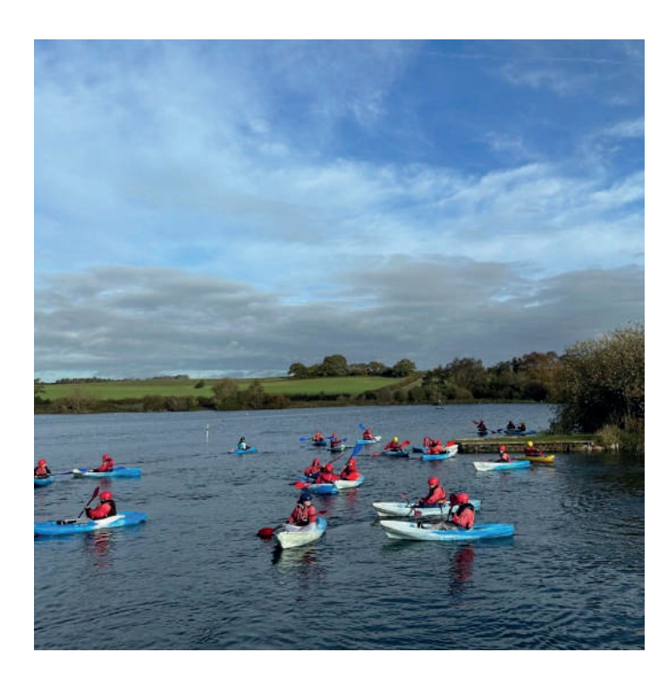
▲"Year 7 residential trip to Manor Adventure for a few days to experience high ropes, stand-up paddle boarding, and orienteering"