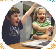
Fun Online Activities for the Whole Family