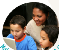
Making Healthy Habits at Home