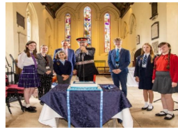
The Lord Lieutenant of Hertfordshire cuts the celebration cake

"It was wonderful to be part of such an occasion and we felt incredibly privileged to share in the experience. We are so grateful to the James Marshall Foundation for supporting some of our students and I hope that our relationship continues for many years to come to support these young people in their ambitions and dreams."